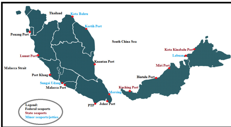
Figure 1. Location of various seaports in Malaysia

In the current challenging lifestyle, stress has been emerged especially from the continues demand to meet basic needs, accelerating demand in the place of work as well as difficulties