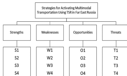
Figure 2. The hierarchy presentation of SWOT analysis

However, the limitation of SWOT analysis is that important quantitative measurements in decision factors cannot be measured. It is not possible to measure priorities for each group and sub-factor, and the decision-maker cannot determine the ranking of the factors (Eslamipoor and Sepehriar, 2014). The typical SWOT is based on qualitative analysis for the