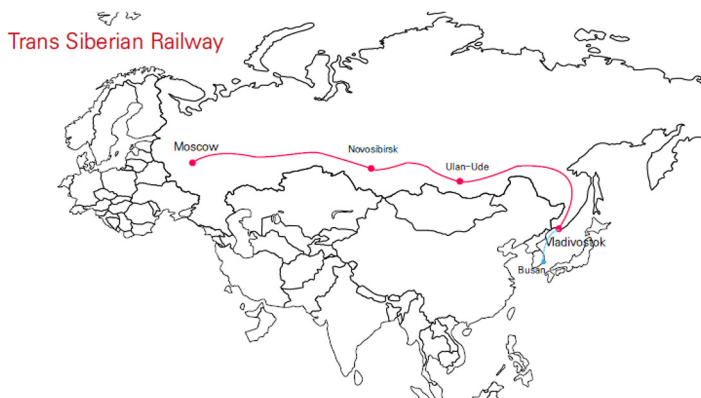
Figure 1. Trans-Siberian Railway

2.2.2 Difference of railway gauge. During the Soviet era, a wide gauge (1,520 mm) was used instead of a standard gauge (1,435 mm) to prevent invasion from outside. The transshipment between different gauges inevitably increases the number of days of transport (Seo et al. , 2017a, 2017b). Also, damage to the item may occur when the gauge is changed by the Eurasian nations (Kim et al. , 2019). During the TSR test run in 2016, the Hyundai Glovis cargo was damaged, with an observed scratching between products.