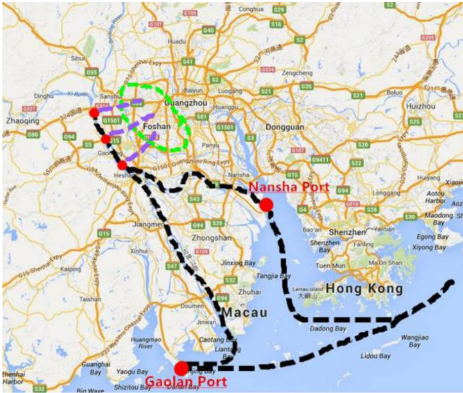
Figure 2. Coal container logistic chain in the south of China

Although the transport via container ships costs more than that by bulk ships, using containers to transport lump coal has certain advantages. According to an internal report provided by Qinhuangdao Port Group, in the process of loading and unloading, about 10 per cent of the lump coal will break into powder, which is apparently a significant loss. Also, to serve small and dispersedly distributed customers, coal container shipments work better because the just-in-time inventory management system can be of great use in reducing financing costs and inventories by ensuring a more constant flow of small tonnages. Besides, additional trailer cost will be spent by the bulk transportation because the big bulk ships cannot navigate on the Xi River and Nansha port is far away from customers. Furthermore, container transport is supposed to be less time costly than bulk transport if the scheduling and sailing speed of container liners are both taken into consideration.